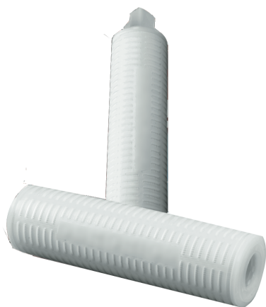
Figure 1: Memtrex PM (MPM) Pleated Filters