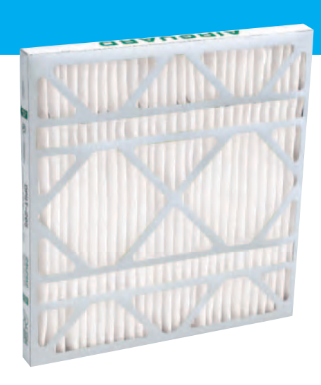
Type DP-SA (Side Access)