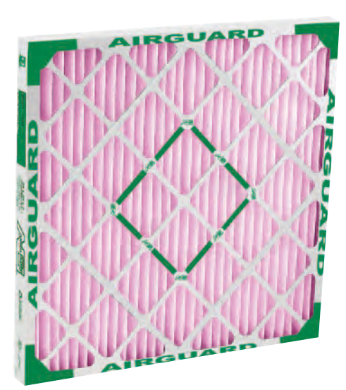
Type DP-High Efficiency