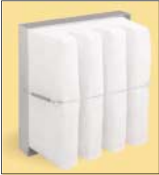
Vari-Pad/Vari+Plus GT filters installed in a holding frame with the spring latch retaining system.

The Vari-Pad is a pocket style prefilter designed exclusively to be installed onto the air entering side of Vari+Plus GT barrier filters operating in the reverse flow orientation. The pockets on the Vari-Pad fit over the four V-bank mini-pleat media packs on the Vari+Plus filter.