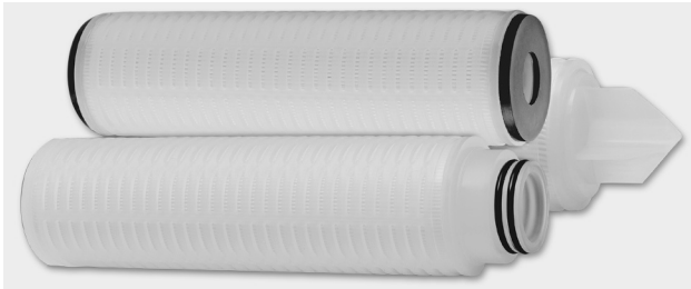
figure 1: Xpleat PES filters